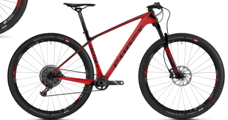
Lector WC.9, 10.9, 9.9 (MY18)